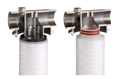
Double Open Ended