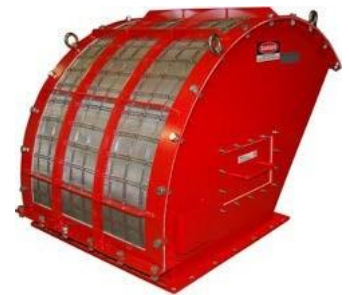
FlamQuench II SQ Flameless Vent

Fike FlamQuench flameless vents are designed to protect people and equipment from flames and dust. In the event of an explosion, flame and dust discharge into the FlamQuench device. The flame from the explosion is extinguished as it travels through several layers of heat-absorbing stainless steel mesh, while dust screens retain a high percentage of particulate. This allows explosion venting to be utilized indoors or when the vent discharge path can be dangerous to personnel.