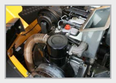
Two strong mechanical drive options – electric or diesel