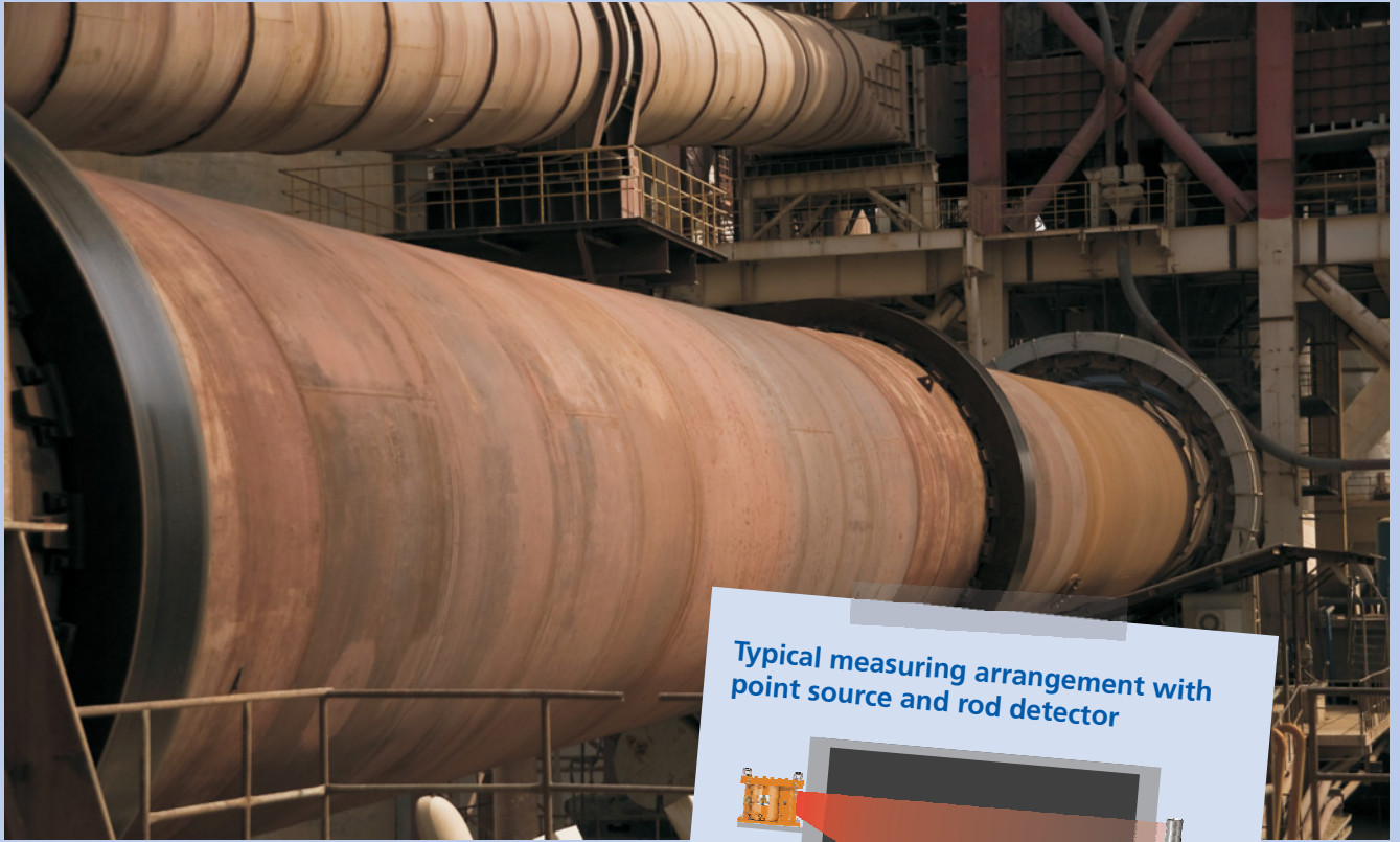
Typical measuring arrangement with point source and rod detector